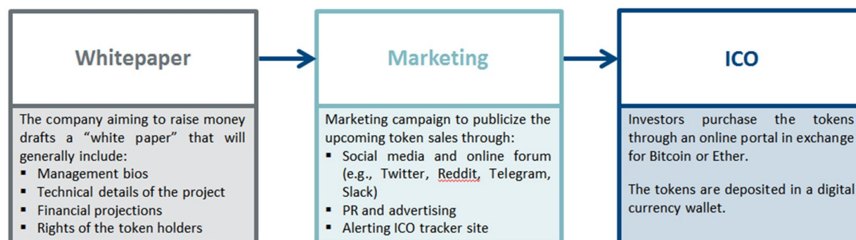
Figure 3: Whitepaper to ICO

As a precursor to an ICO, some companies have recently been raising an initial round of capital through a Simple Agreement for Future Tokens ("SAFT"). The proceeds are used to develop the network and technology to create the token. Under a SAFT, the company accepts funds (fiat currency) from an investor in exchange for documentation that provides access to the tokens if and when they are created. 5